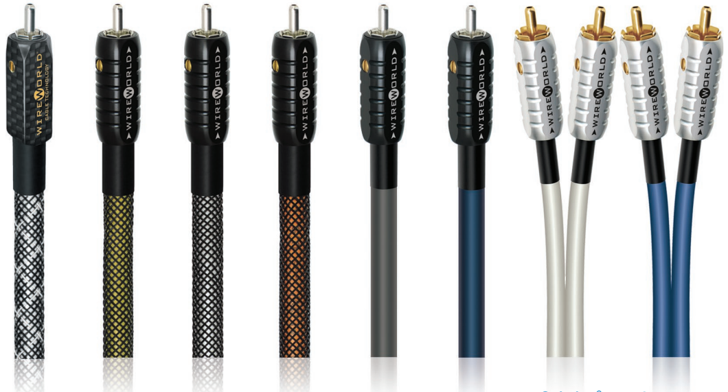
Platinum Eclipse™ 7 PEI

In addition to the advantages of Composilex 2 and DNA Helix technologies, Wireworld interconnects also feature superior patented connectors, and many of the cables utilize conductor materials of the highest purity available (OCC Ohno Continuous Cast®). These qualities are essential in producing the highest fidelity interconnects at each price level. These extraordinary cables are also available in subwoofer, multichannel and tonearm configurations.